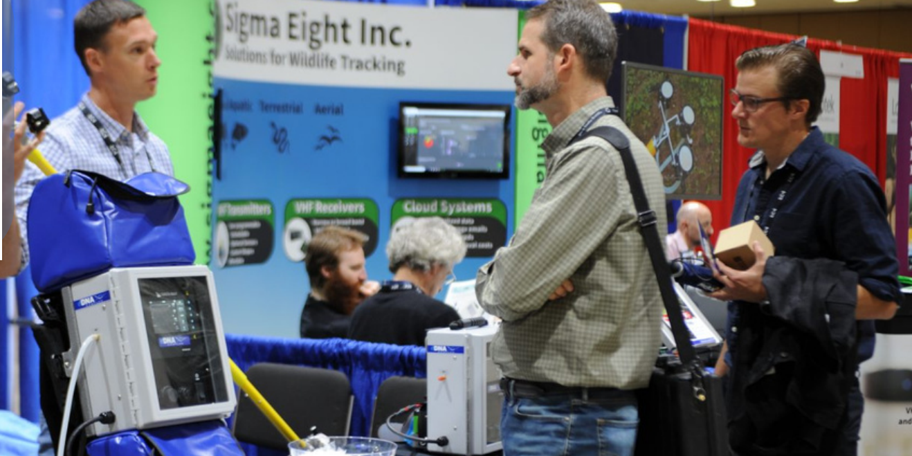
EXHIBIT AT THE LATIN AMERICA AND CARIBBEAN FISHERIES CONGRESS!